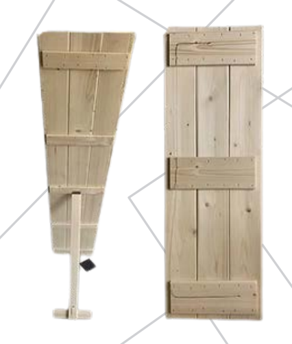
PACKAGING: 20 PER CASE CUSTOM SIZES AVAILABLE UPON REQUEST

WOOD BOARDS NEW! Porch Leaners (10" x 47" with a leg, 10 per case)