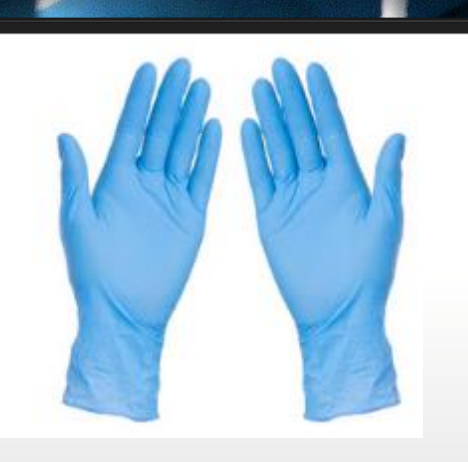
Nitrile Gloves (Box of 100)

Nationwide Medical Supply, Inc. is a leading supplier of top quality, medical grade PPE. We're dedicated to providing the equipment you need for perfect protection.