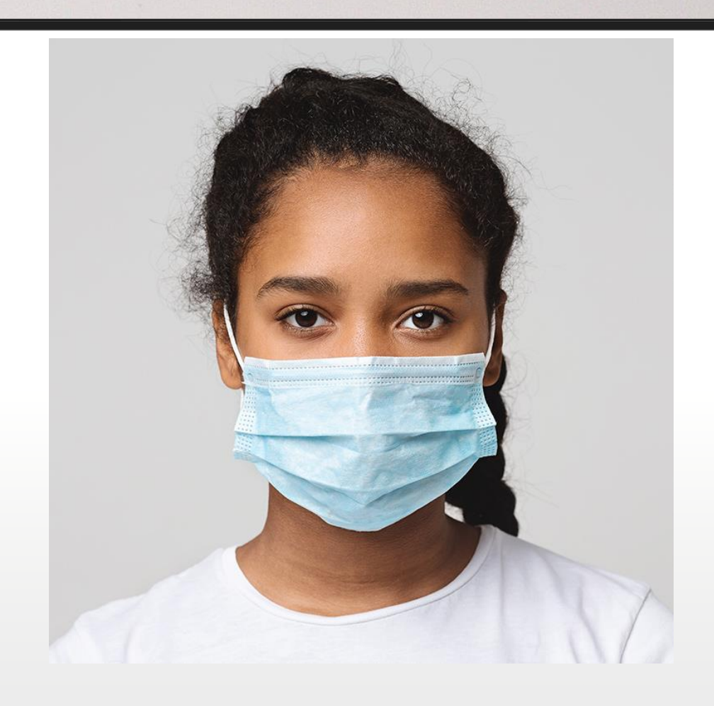
General Public Face Mask