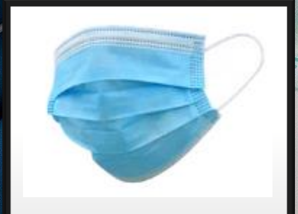
3-Ply Face Mask (Box of 50)