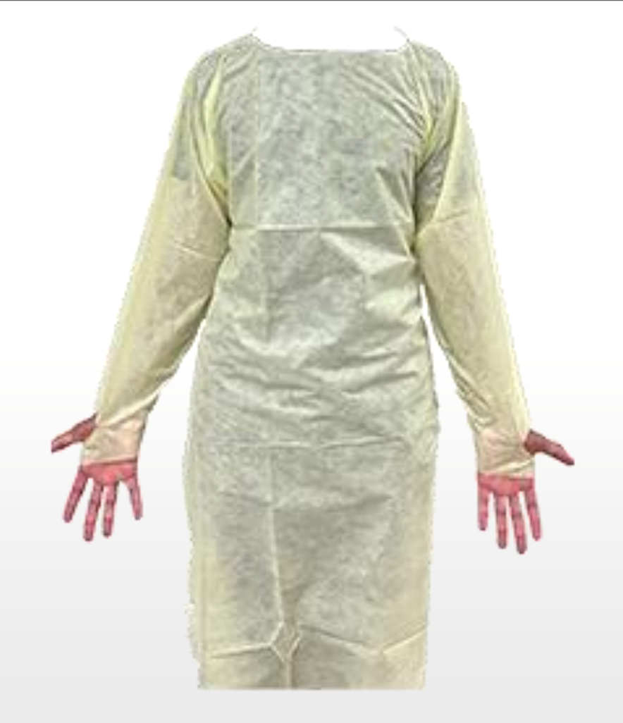
AAMI Level 2 Disposable Gowns "Sunshine" (Case of 100)