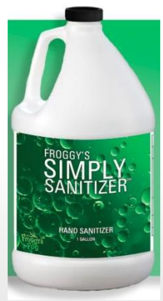
Froggy's Sanitizer 1 Gallon