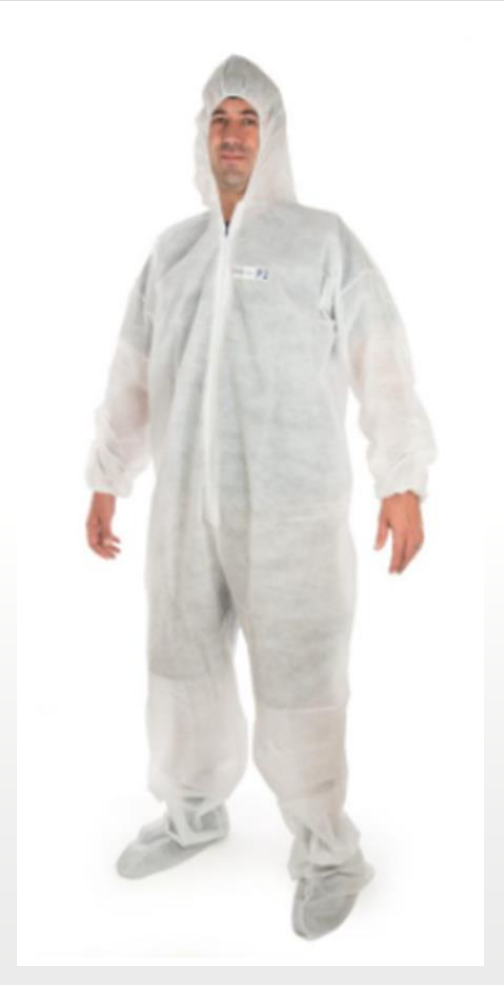
Hooded Coveralls Sizes 2x, 3x, 4x